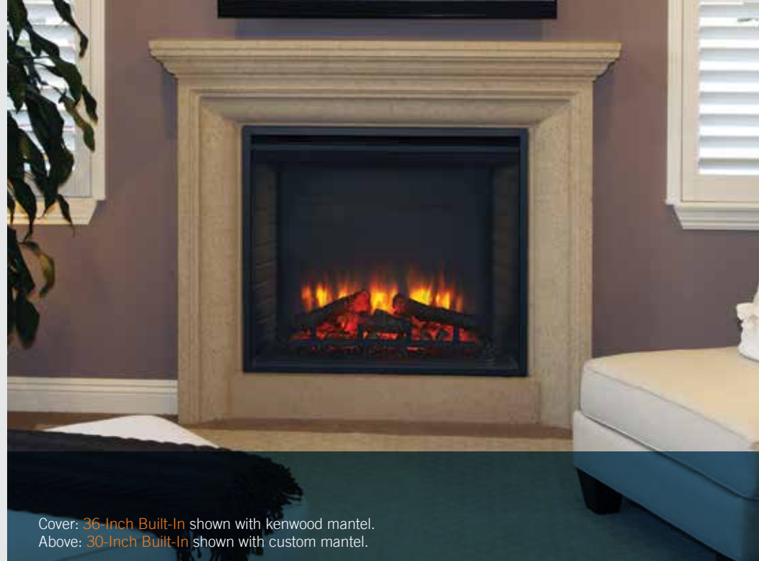
Cover: 36-Inch Built-In shown with kenwood mantel. Above: 30-Inch Built-In shown with custom mantel.